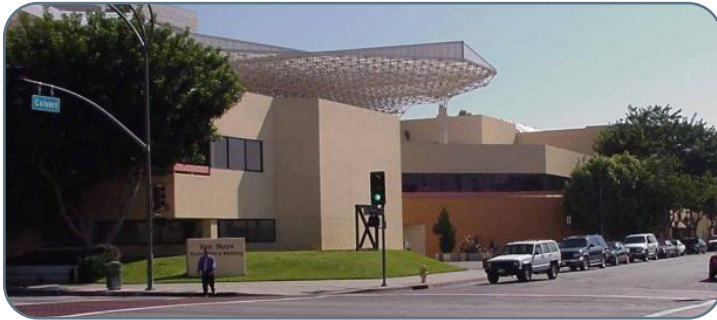
Van Nuys State Building