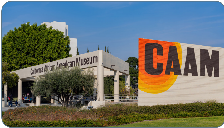
California African American Museum