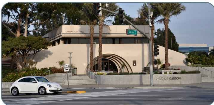
Carson City Hall