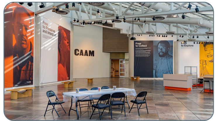
California African American Museum